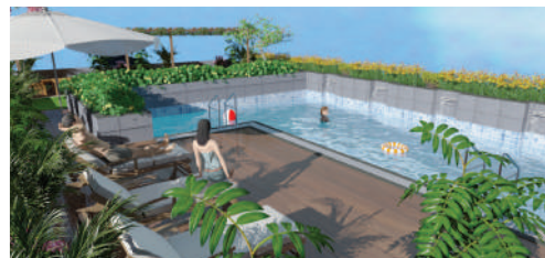
Swimming Pool at Podium