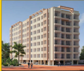
GARDEN COURT BHAYANDER (W)