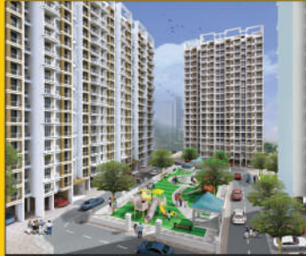
NAKSHTRA GREENS PHASE 2 NAIGAON (E)