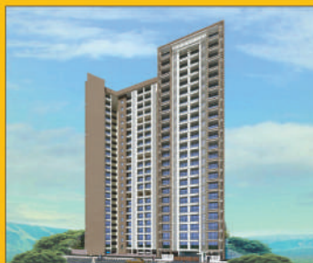
NAKSHTRA PRIDE 2 NAIGAON (E)