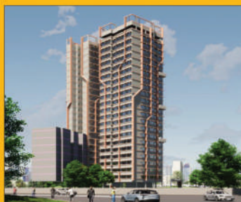
NAKSHTRA TRIDENT VIRAR