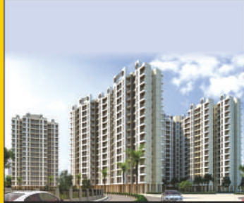
NAKSHTRA PRIMUS NAIGAON (E)