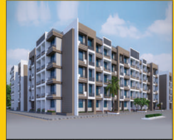
NAKSHTRA RESIDENCY MAKANE, PALGHAR.