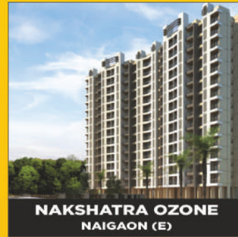
NAKSHTRA OZONE NAIGAON (E)