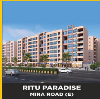
RITU PARADISE MIRA ROAD (E)