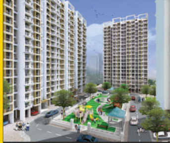
NAKSHTRA GREENS PHASE 1 NAIGAON (E)