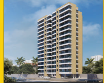
NAKSHTRA TOWER MIRA ROAD (E)