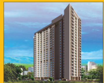
NAKSHTRA AARAMBH NAIGAON (E)